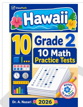
10 Practice Tests