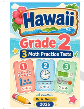
3 Practice Tests