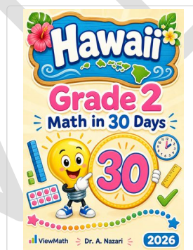
Math in 30 Days