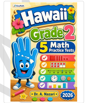
5 Practice Tests