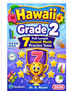
7 Practice Tests