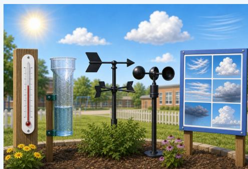
Observing and measuring weather