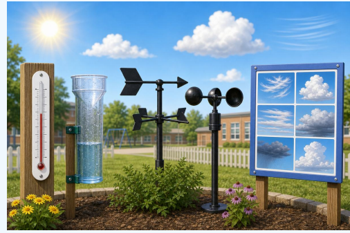
Observing and measuring weather