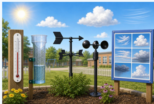
Observing and measuring weather