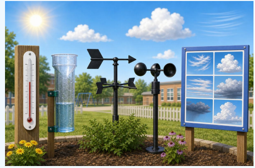
Observing and measuring weather