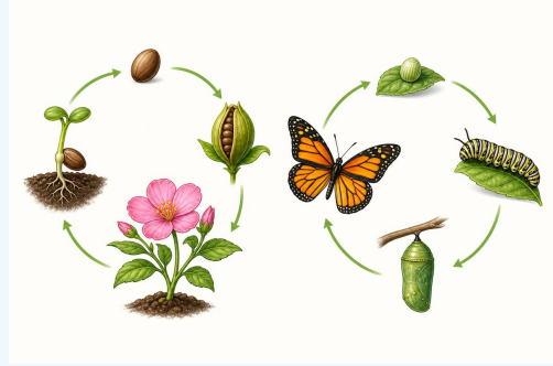
Plant and Animal Life Cycles: study the picture, model, or data before answering.