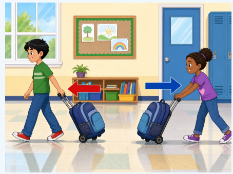
Pushes and Pulls: study the picture, model, or data before answering.

Check yourself: A strong answer names the science idea and uses evidence, data, a model, or a clear example.