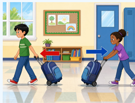
Pushes and Pulls: study the picture, model, or data before answering.

Check yourself: A strong answer names the science idea and uses evidence, data, a model, or a clear example.