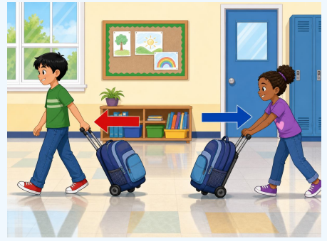
Pushes and Pulls